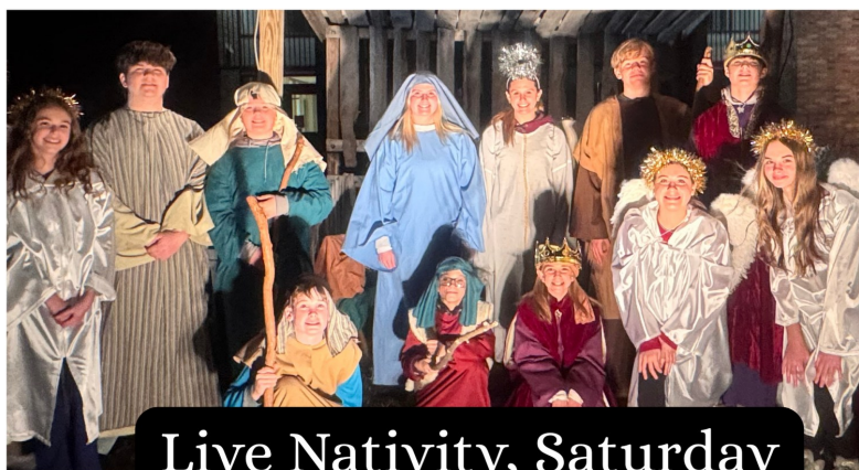
Live Nativity, Saturday