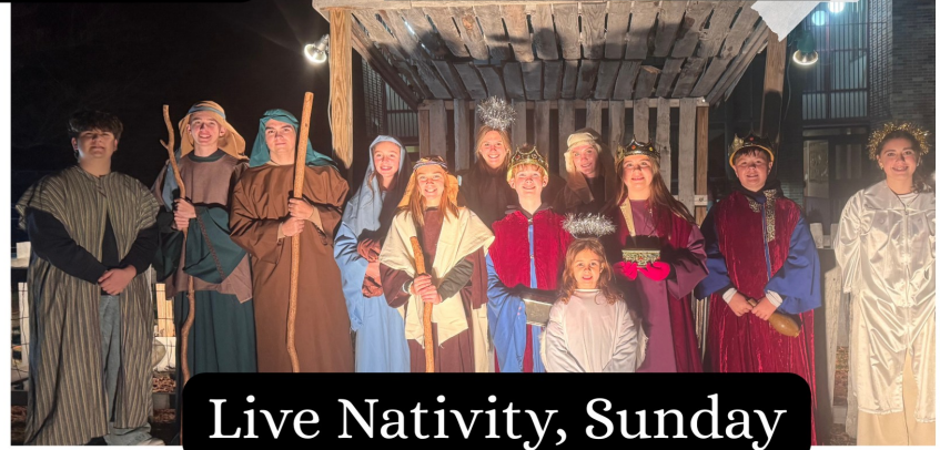
Live Nativity, Sunday